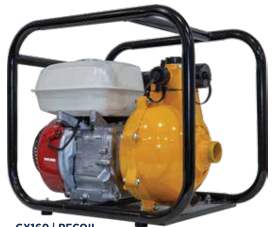
GX160 | RECOIL